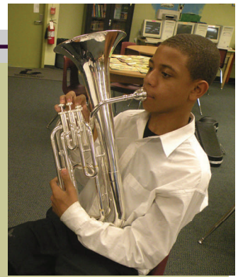
Pictured above are students from Johnnie Coleman Academy.

The Kroc Center, along with the Youth Department and Music Department visited schools in the service area. The Music Department provided a concert as the children sang along. Schools visited included: Johnnie Coleman Academy, West Pullman Elementary, Garvey, Higgins Community Academy, Wendell Smith, W.E.B. Du-Bois School, & Whistler. The theme was, "You Have to Read to Succeed," placing an emphasis on literacy. Seven schools in the area were provided this opportunity and 1,415 students received school supplies.